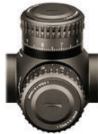
MRAD Models "1 Click = 0.1 MRAD"