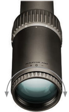
Adjust the reticle focus.

Once this adjustment is complete, it will not be necessary to re-focus every time you use the riflescope. However, because your eyesight may change over time, you should re-check this adjustment periodically.