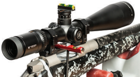
Using bubble levels to square the riflescope to the base.

Note: After aligning the reticle, tighten and torque the ring screws down. Vortex® Optics recommends a torque setting of 15-18 in/lbs on the ring screws.