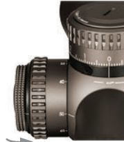
Push in to lock.