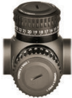
MOA Models "1 Click = 0.25 MOA"

Depending on which version you have purchased, your Razor® HD Gen II riflescope will feature adjustments and reticles scaled in MOAs or MRADs. Both minute-of-angle (MOA) and milliradian (MRAD) unit of arc scales are equally effective when ranging or adjusting riflescope for bullet trajectory.