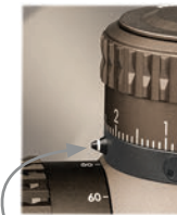
Turret in second turn of rotation (partially extended).