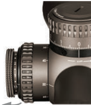
Pull out to unlock and adjust.

To activate the illumination, pull out the dial and adjust by rotating the adjustment dial in either direction. The illumination dial allows for 11 levels of brightness intensity; an off click between each level allows the shooter to turn the illumination off and return to a favored intensity level with just one click.