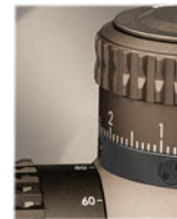
Turret in first turn of rotation (not visible).

The external indicator on the elevation turret provides quick visual and tactile reference of the elevation turret's rotational position. As the turret enters the second turn of rotation, the indicator will extend outward from the turret. On the third turn of rotation, the indicator will be fully extended.